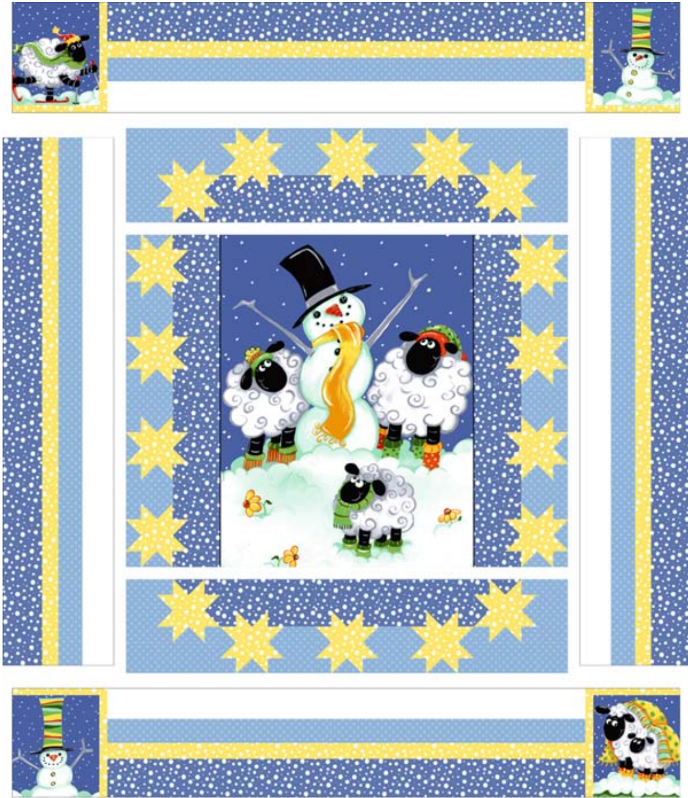
Exploded Quilt Diagram